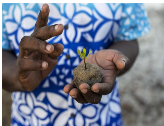
In pictures: Kenya's coastal conservation heroes by UN Environment