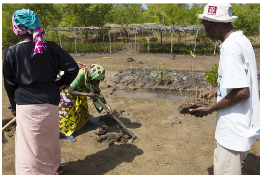
Mangrove conservation and carbon trading in Vanga Bay, Kenya

If you would like to receive an email notification when individual stories are published please scroll to the end of a story on our news blog, enter your email address and click "SUBSCRIBE TO STORIES".