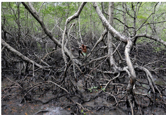
Mud crab fishing in Brazil BBC News