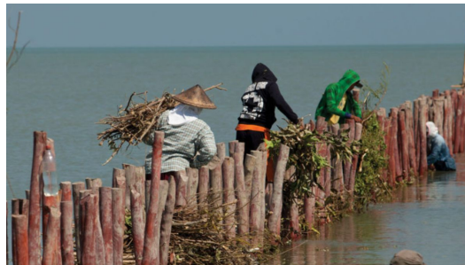
Nature-based adaptation on Java's coast Fred Pearce, Yale School of Forestry & Environmental Studies