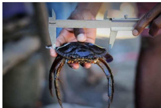
Clawing back a sustainable future Ben Honey, Blue Ventures